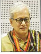
JISHNU DEV VARMA DEPUTY CHIEF MINISTER